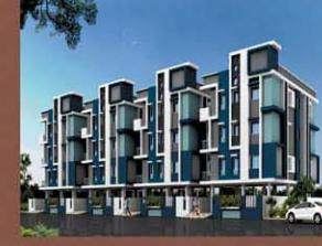
GSR'S Eco Nest, Thunglam, Gajuwaka