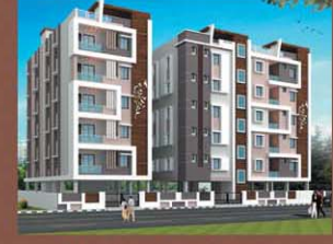
GSR'S Vasishtha, Sheela nagar.