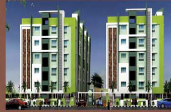
GREEN LIFE APARTMENTS, Gajuwaka